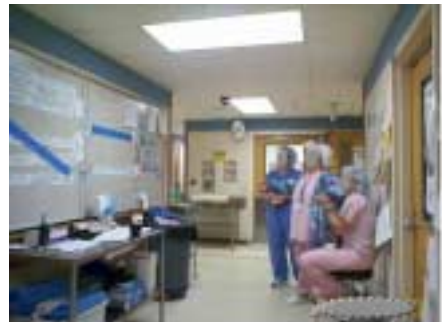
Figure 2. Public whiteboard at the UM Shock Trauma Center

Shared visualizations. Shared visualizations, either on public displays or individual computing devices, can help workers maintain shared mental models of other staff, resource, and patient trajectories (as illustrated in Brewer [2000] and the ongoing work by the SAGE Visualization Group at CMU [ http://www-2.cs.cmu.edu/Groups/sage/sage.html ]). We will explore alternative methods for instantiating shared visualizations to determine what methods best facilitate large scale coordination of trajectories. to other pertinent research at other locations.